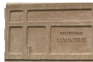
Recessed panel back and weep channels.