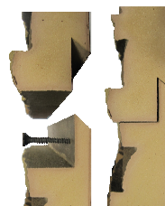
Tongue and groove top-to-bottom interlock.