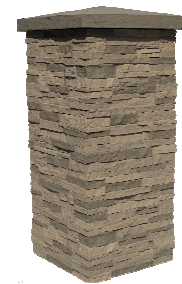
Stacked Stone– Kentucky Gray Column with 18" Gray Cap

Stacked Stone panels and corners retro-fit with Drystack panels!