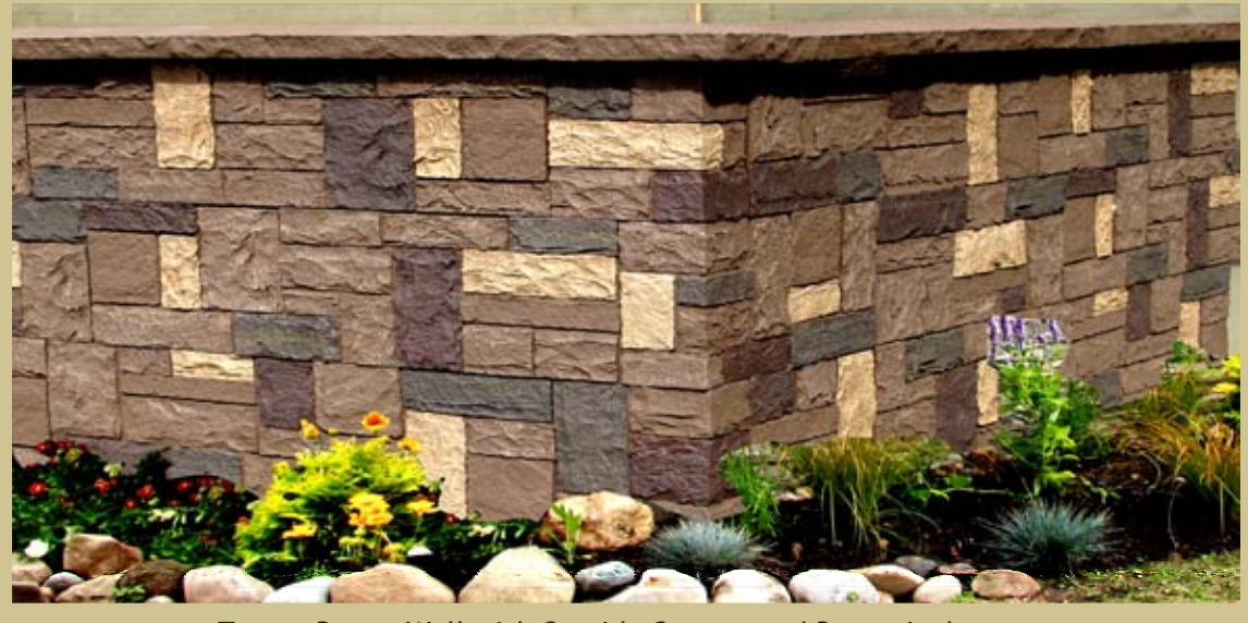
Tuscan Brown Wall with Outside Corners and Brown Ledger